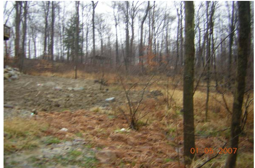
Photo 62: View ENE along CE on SL 102. Muddy residue from landscaping.