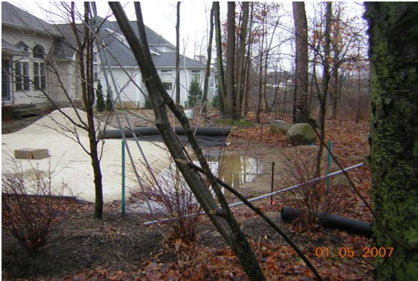
Photo 49: View SW along CE boundary and patio construction on SL 44.