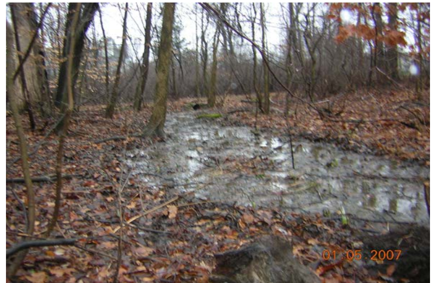
Photo 60: View SW into CE on SL 103 of wetland area with skunk cabbage.