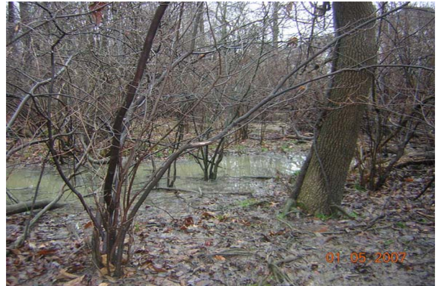
Photo 54: View E within CE on SL 47. Floodplain of stream with skunk cabbage and thick shrubs.