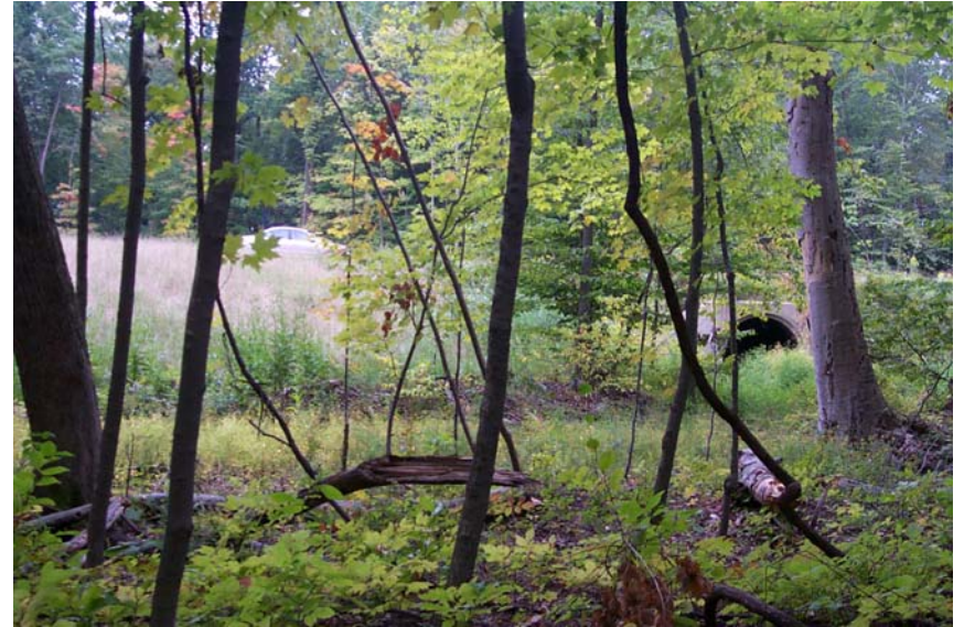
Photo 26: S to Prairie Crossing along CE to right, SL 161 to left.