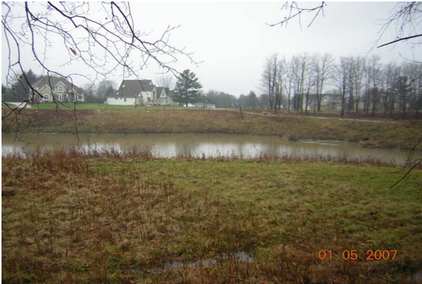
Photo 57: View SW into detention basin outside of CE with my back to SL 104.