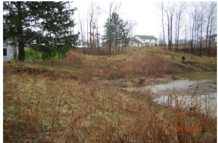
Photo 56: View SE along CE on SL 47 to where stream flows into detention basin. CE to left.