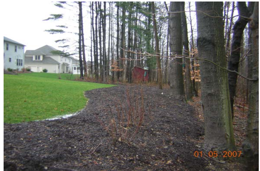
Photo 44: View SW of encroachment in SL 41. Tree to left in background has OSP sign. CE to right of it.