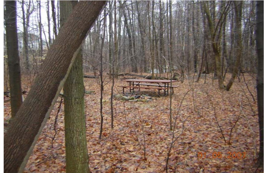
Photo 46: View NW of picnic table and fire pit with stream behind on CE on SL 43.