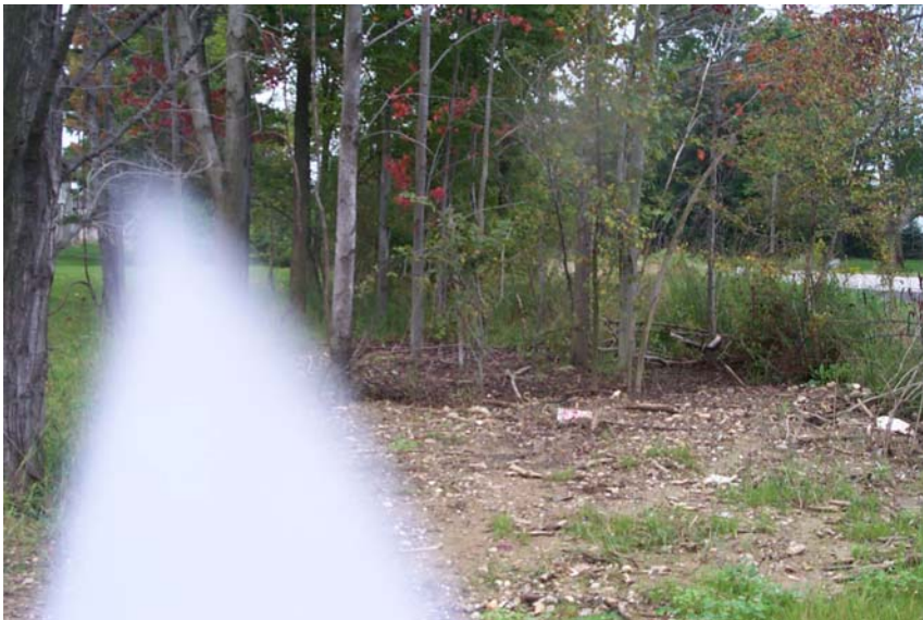
Photo 3: View S into CE at corner of whispering Woods Drive and Valley View.