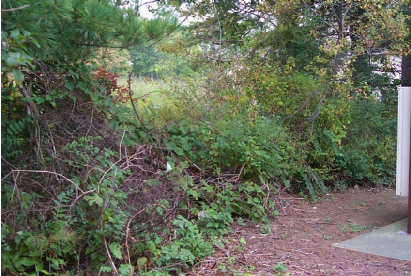
Photo 5: View NE into CE, to model home on SL 114 from Valley View.