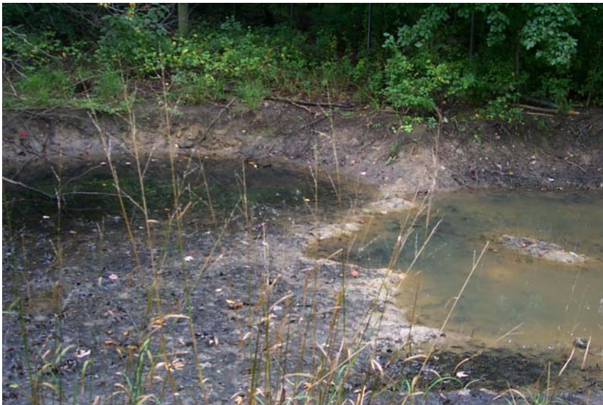
Photo 15: Dug out pond with berm and drainage basin in CE off SL 22.