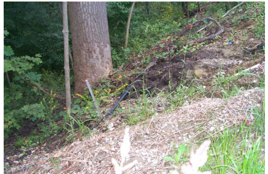
Photo 32: NW along CE to left, fill flowing into CE from model on SL 62 to right.