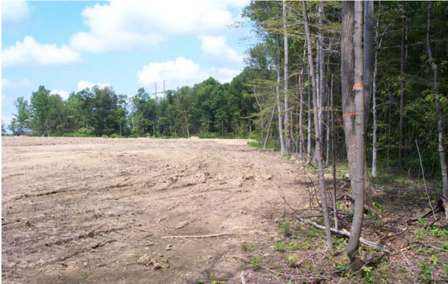
Photo 21: West from Stormwater Basin behind S/L 402 Wilmington Drive