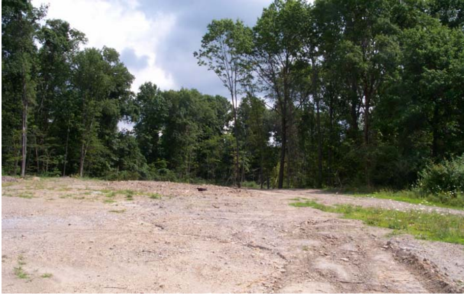
Photo 25: Northeast to Laughton Circle behind S/L 145 Hamilton Drive