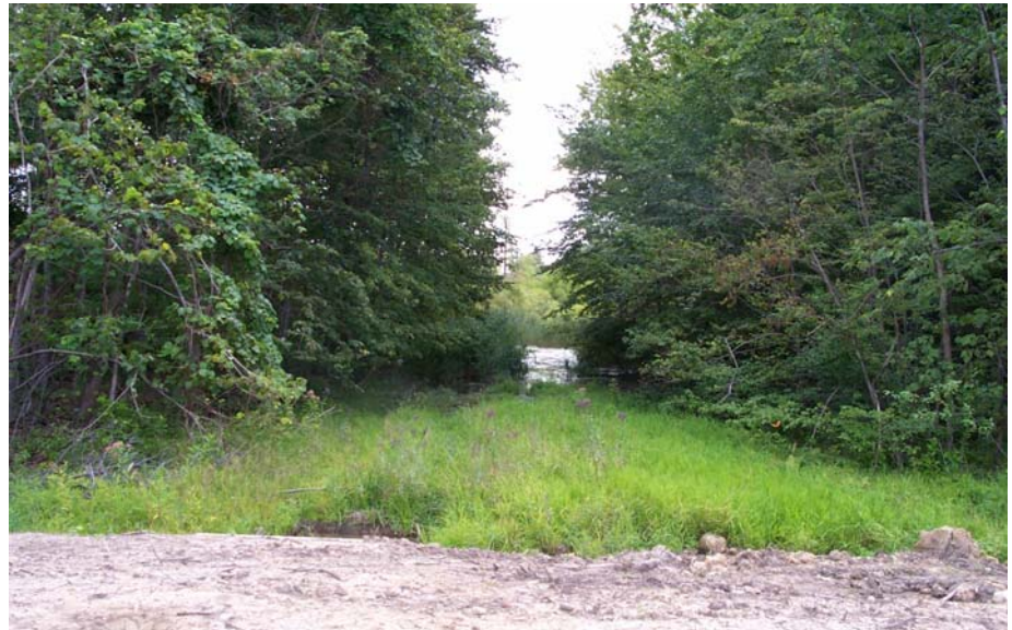
Photo 20: East from Stormwater Basin behind S/L 402 Wilmington Drive