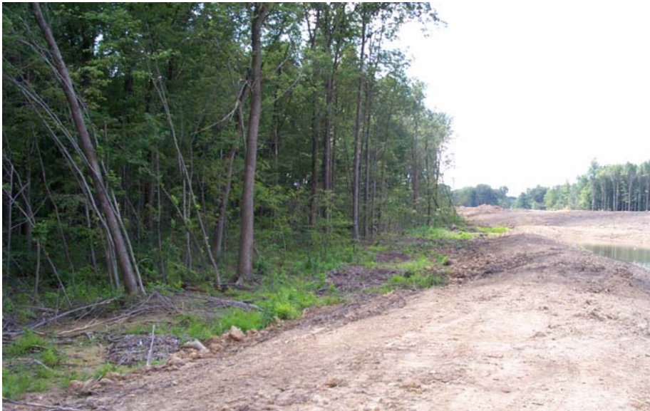
Photo 19: South from Stormwater Basin behind S/L 402 Wilmington Drive