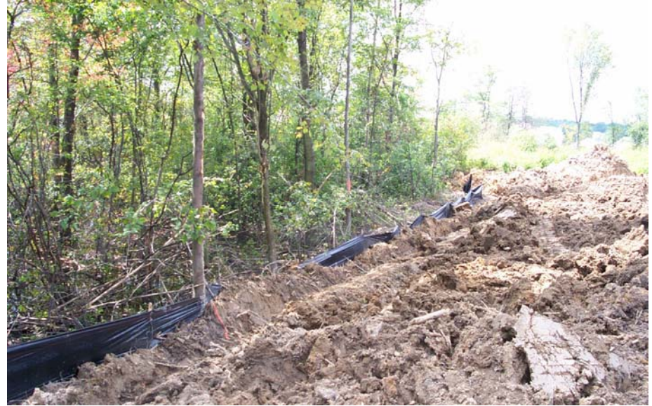
Photo 30: Southeast from behind S/L 510 Stratford Drive...Encroachment